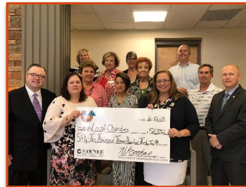
2018 COMMUNITY CHARITY RECIPIENTS