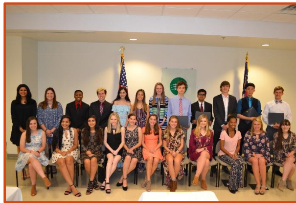
2018 YOUTH SCHOLARSHIP RECIPIENTS