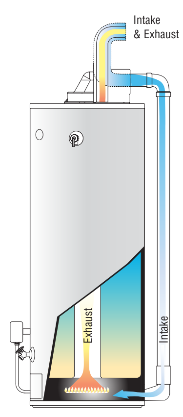
Direct vent gas water heater